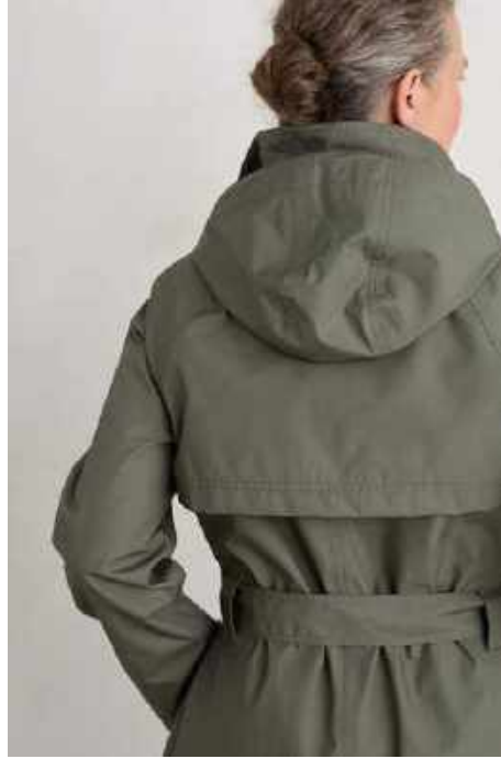
Lidia wears: Penweathers Trench Coat light nori • QC 561 Sailmaker Shirt mid wash sand • QC 175 Carvannel Trousers ecru • QC 162