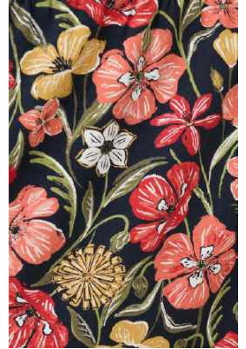
Deep Water Dress folky poppy inkwell • QC 462