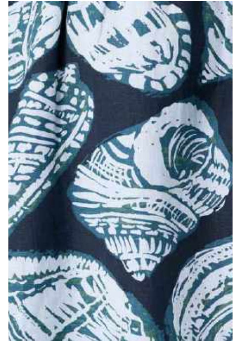
Sea Drift Dress pocket shells inkwell • QC 435