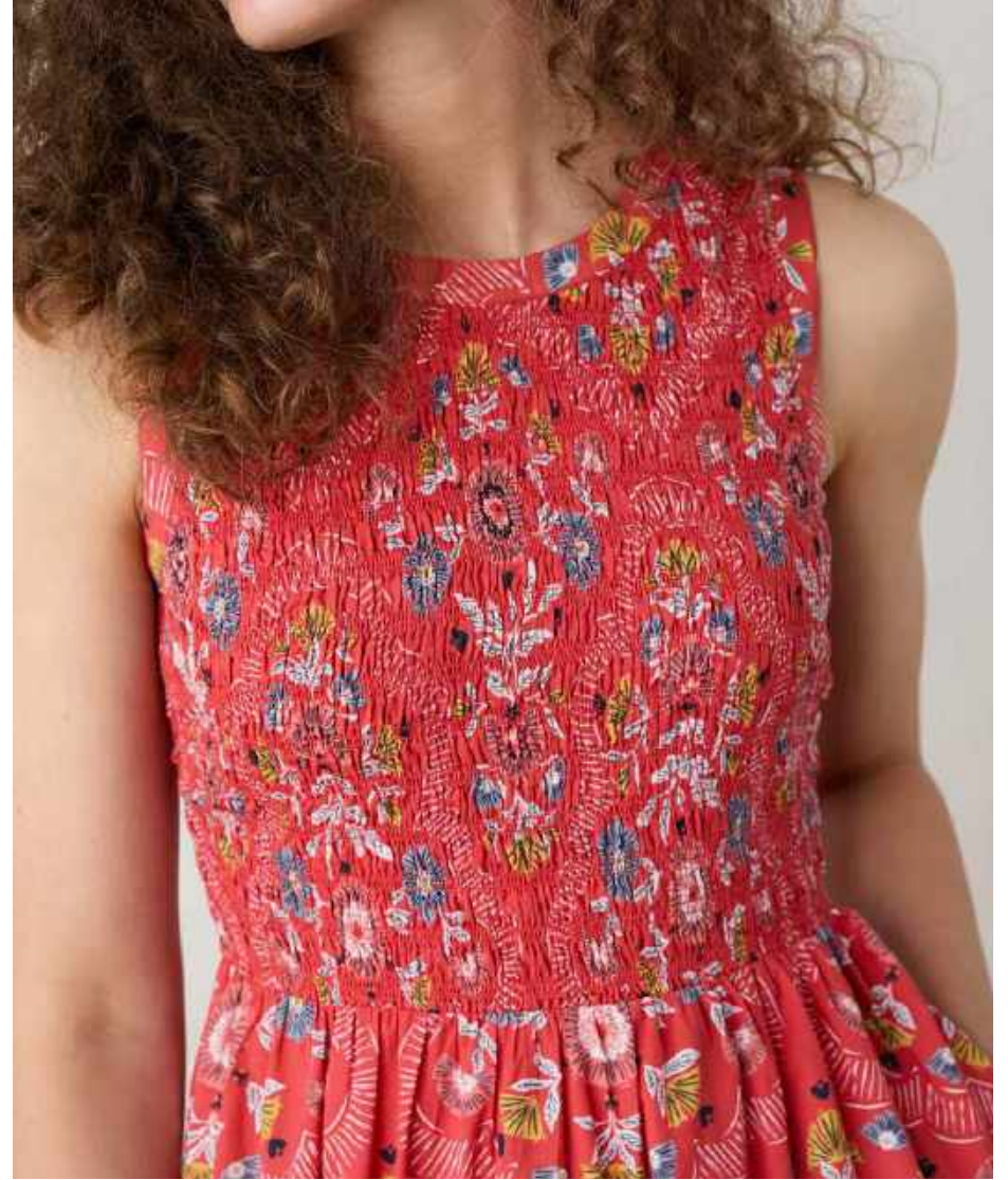
Sleeveless Meadowsweet Dress meadow border tomato • QC 465