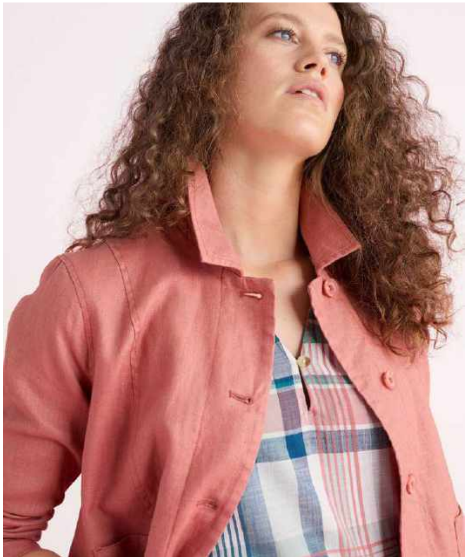
Arame Jacket clover • QC 357