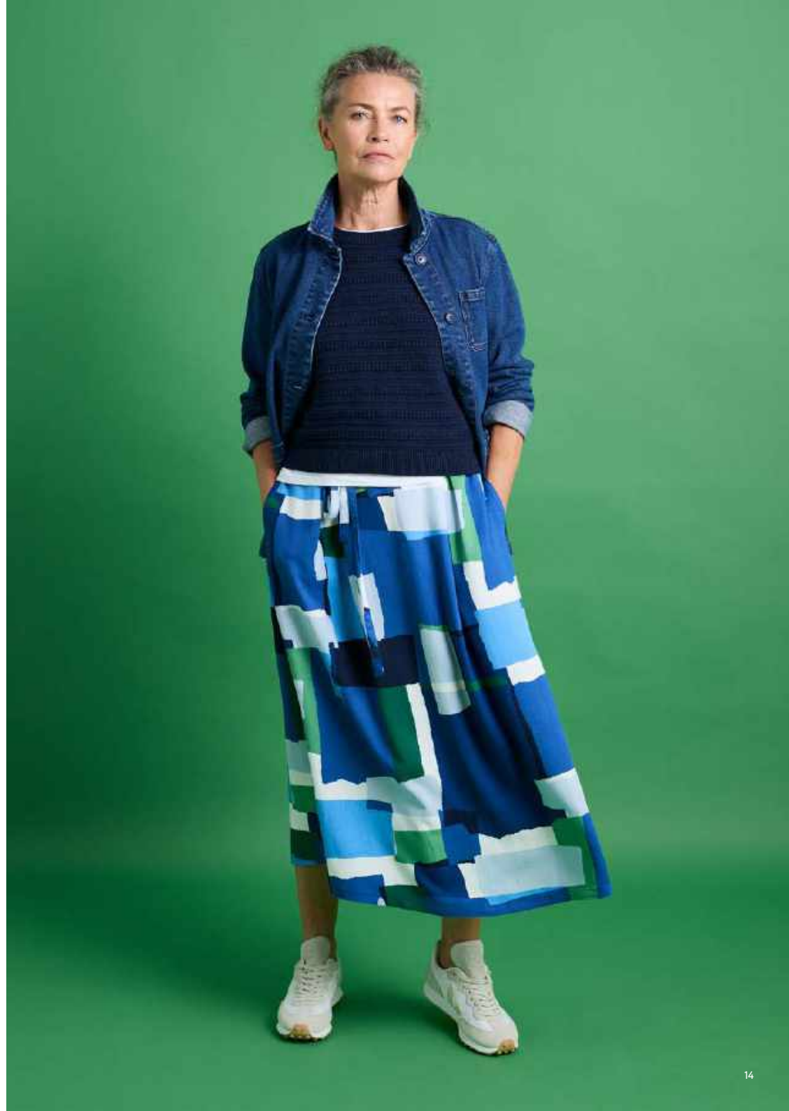
Allantide Skirt francis collage blue jay • QC 184