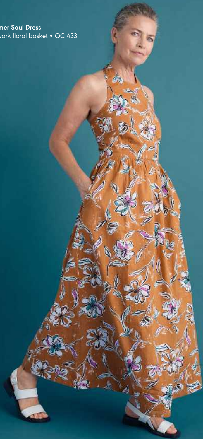
Summer Soul Dress Linework floral basket • QC 433