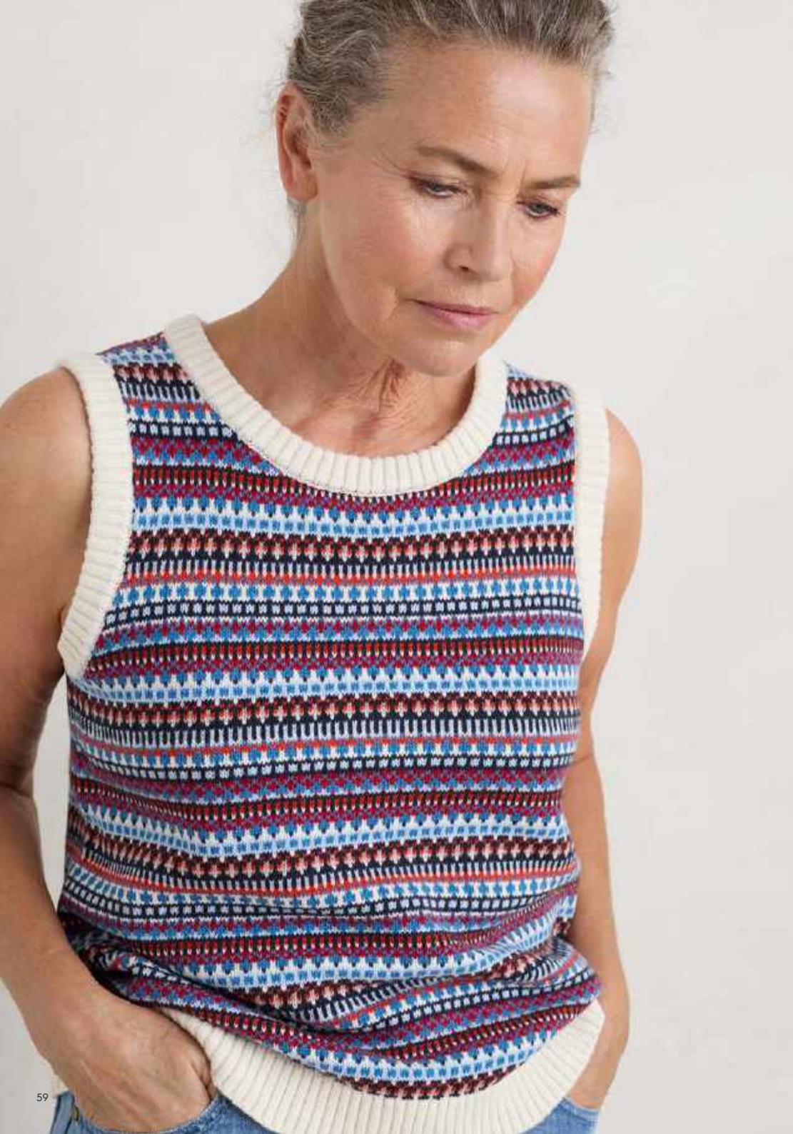
Little Grebe Vest seaglass sailboats multi • QC 371