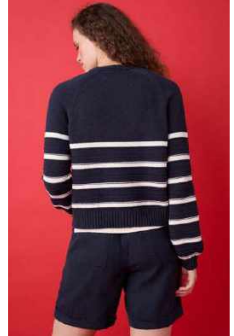
Castle Beach Cardigan porthole maritime chalk • QC 387