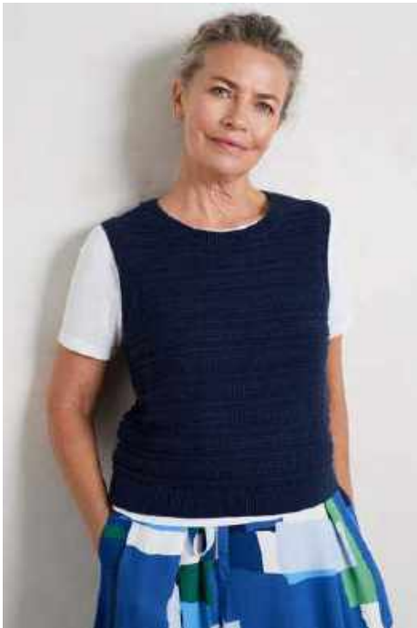
Tepel Vest maritime • QC 130