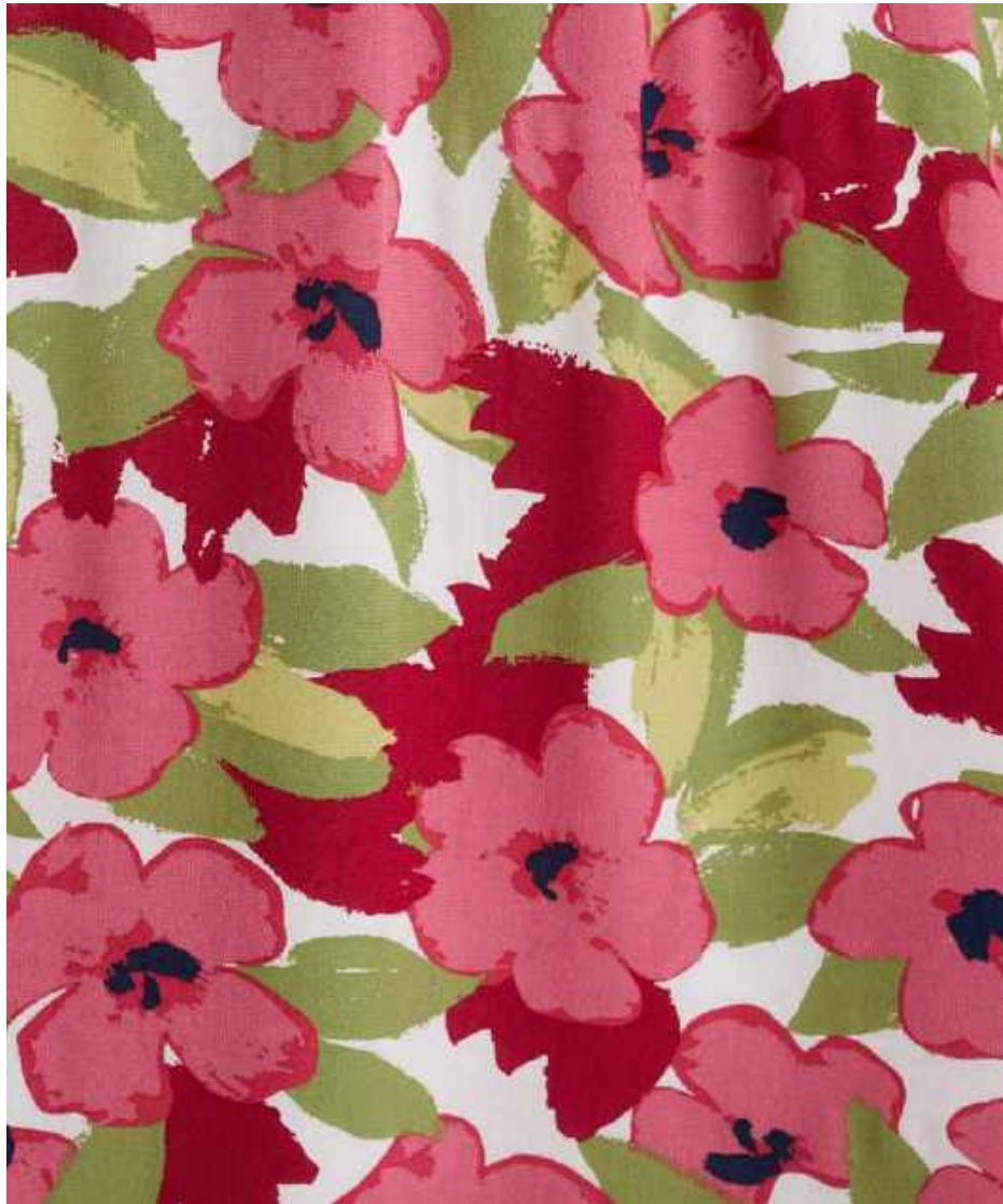
Birch Leaf Dress coastal bloom chalk • QC 244