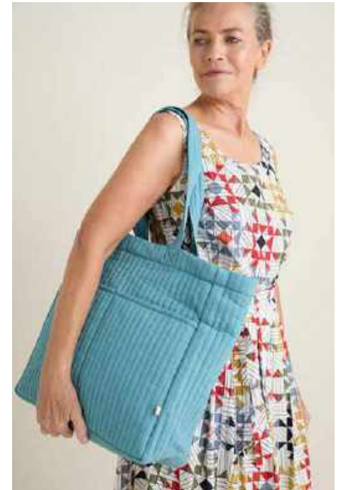
Belle Dress quilt star chalk • QC 457 Singing Water Bag watercress • QC 605