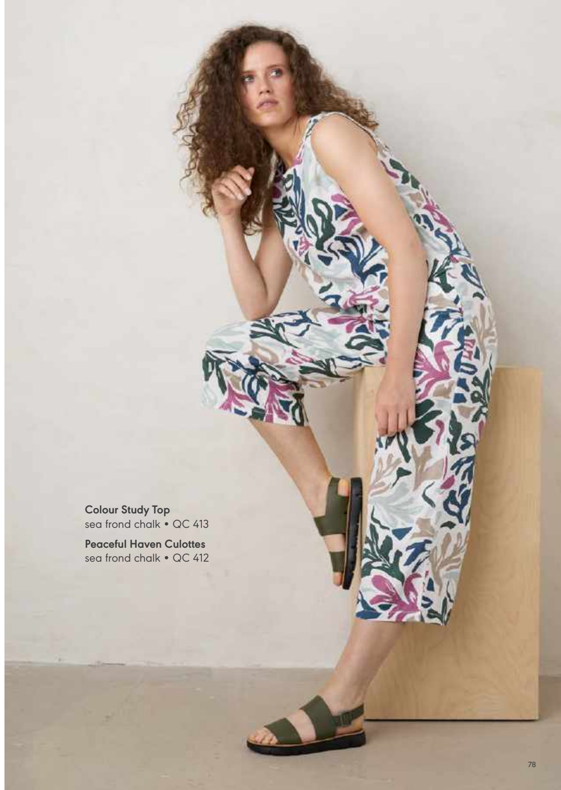
Colour Study Top sea frond chalk • QC 413