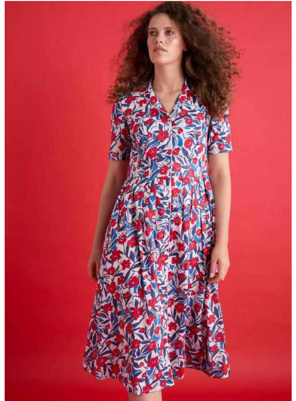
Charlotte Dress waterway floral chalk • QC 374