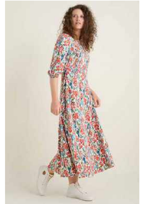
Pellar Dress marsh marigold chalk • QC 235