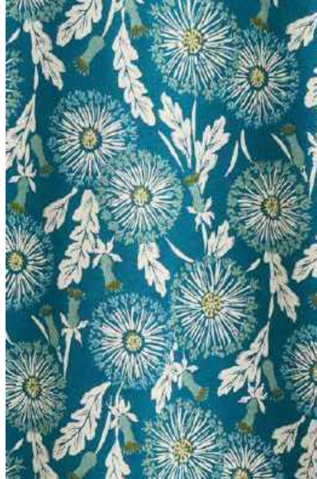
Toni wears right: \frac{3}{4} Secret Cove Dress dandelion seed seaway • QC 230