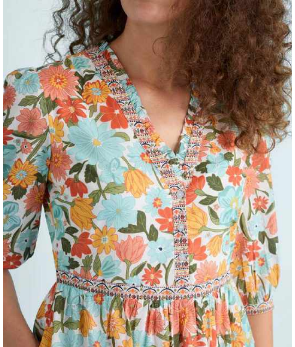
Blue Hills Border Dress flowering blooms chalk • QC 282