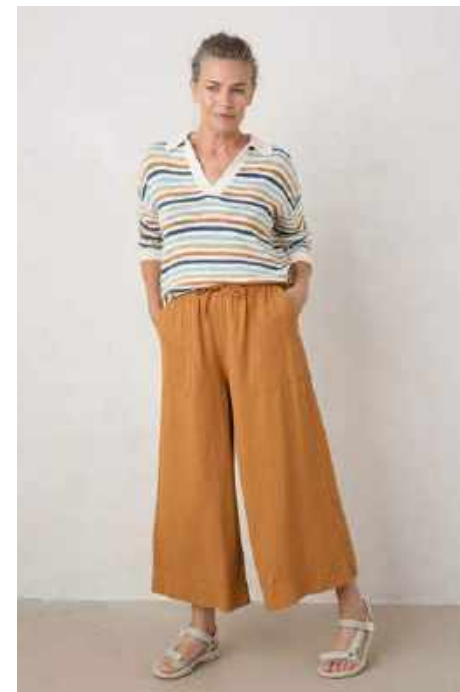
Gwynver Jumper mini cornish pool mix • QC 403