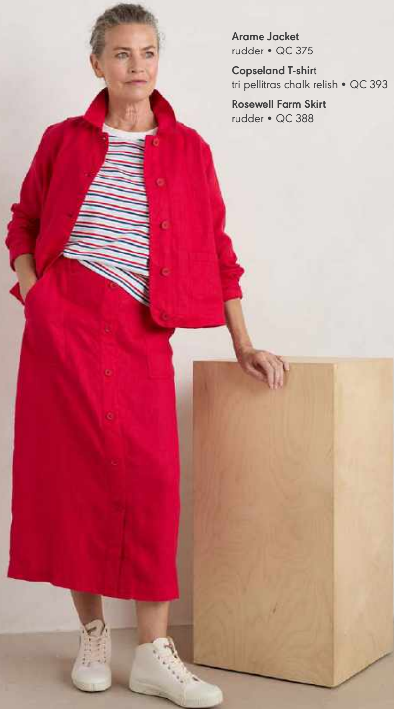
Arame Jacket rudder • QC 375 Copseland T-shirt tri pellitras chalk relish • QC 393 Rosewell Farm Skirt rudder • QC 388