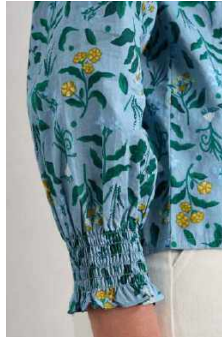
Toni wears left: Last Leaf Top fresh blooms blue fog • QC 161 Carvannel Trousers ecru • QC 162