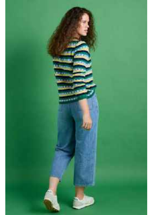
Clover Bed Jumper croquet island multi • QC 174