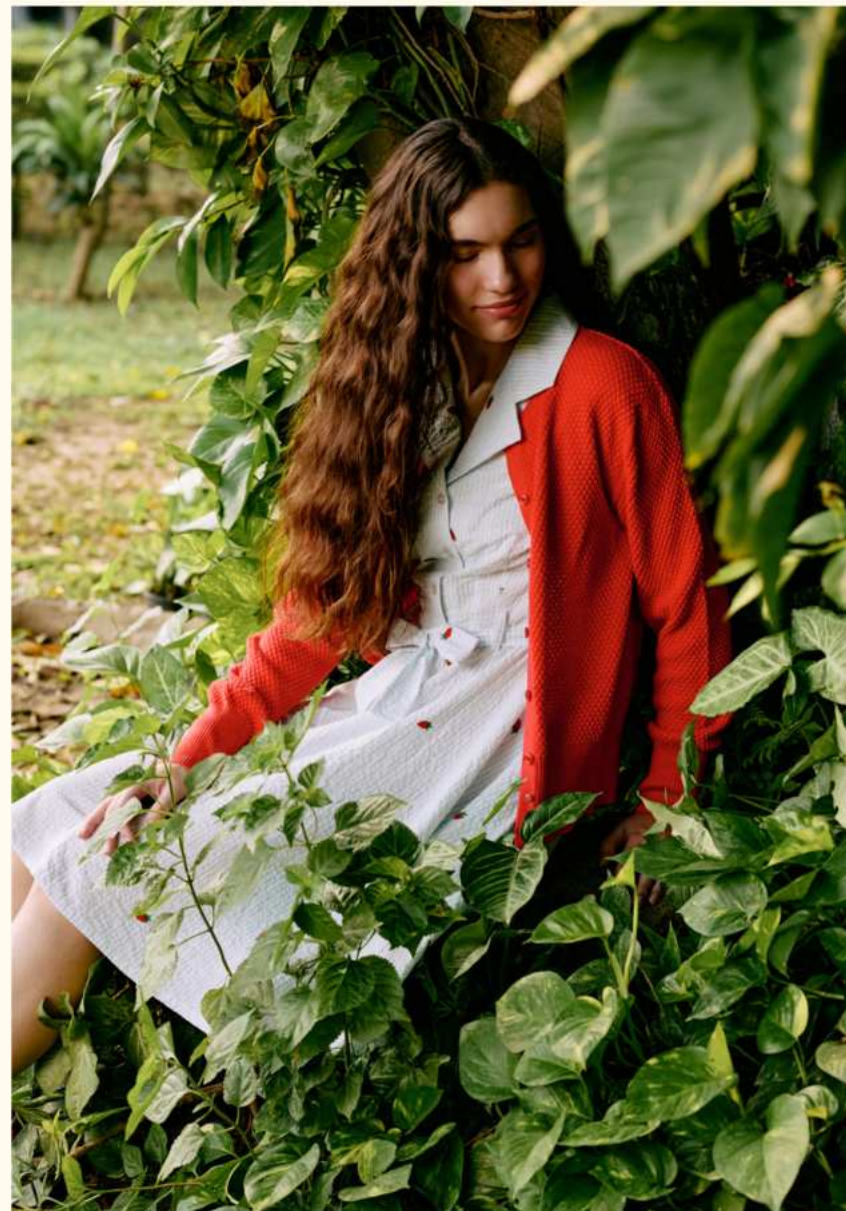
CD405 Berries embroidery