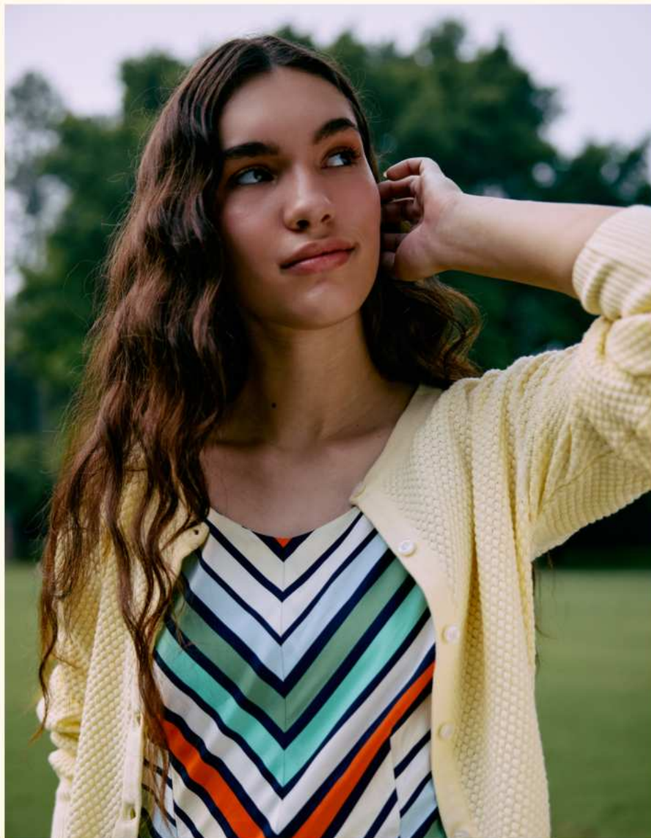
CK05 Bauble pear sorbet