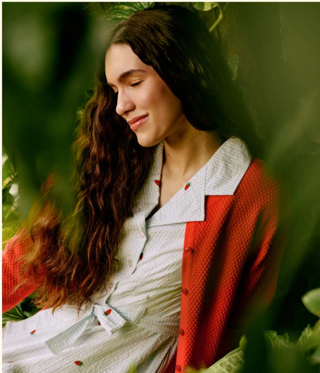
CK05 Bauble Hibiscus