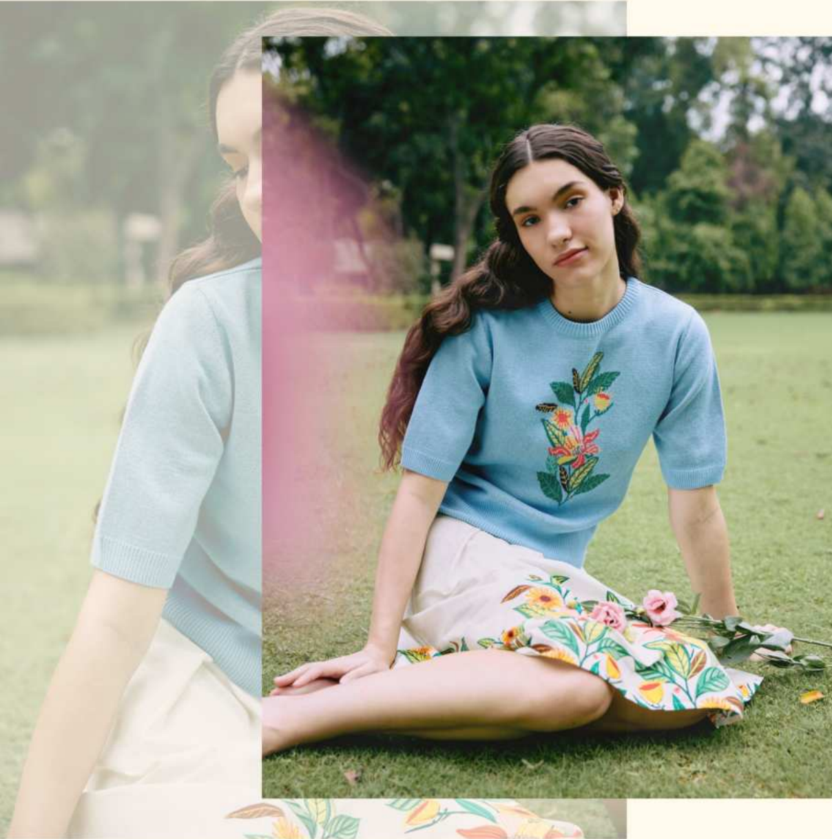
CK146 Mono maui