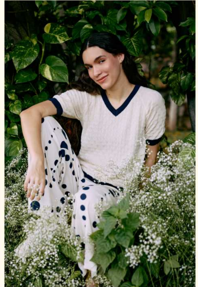
CK173 Diamond ivory