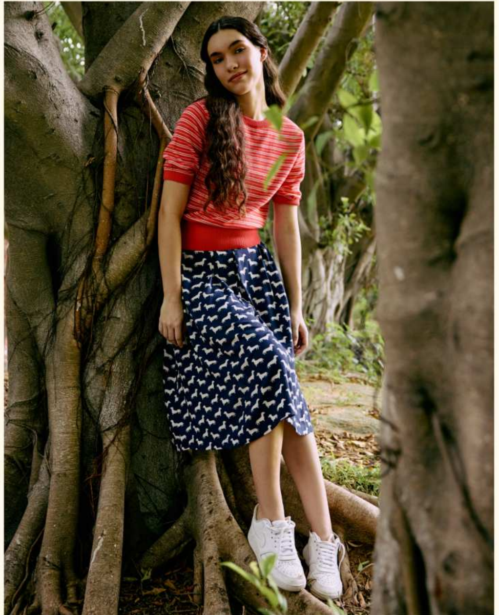
CK146 Pinstripe Hibiscus