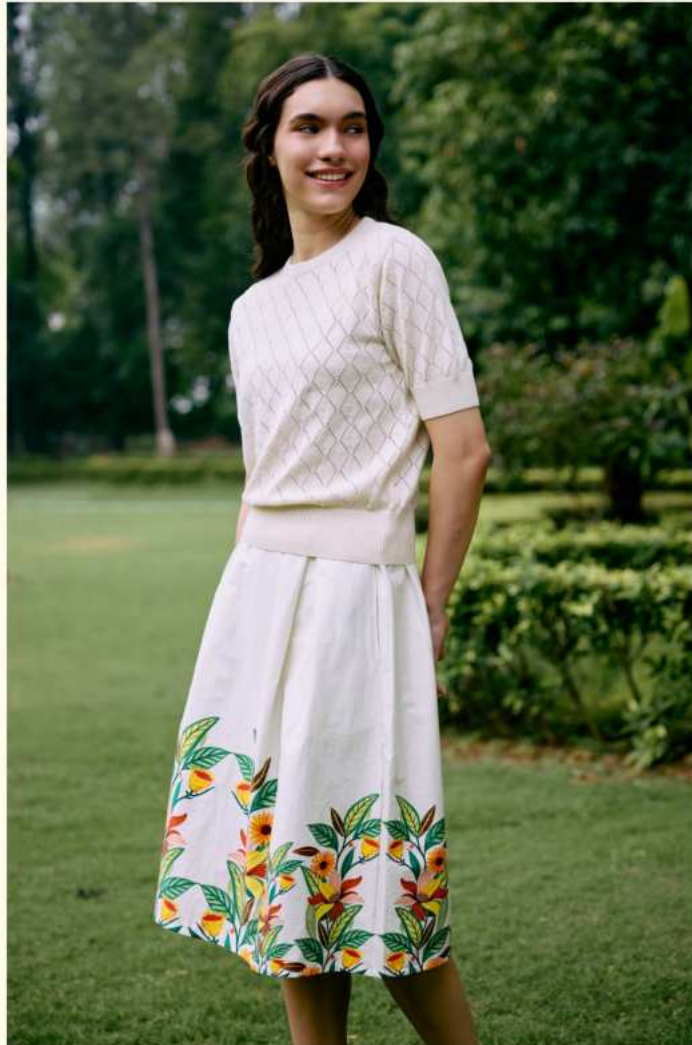
CS6018 Maui Border