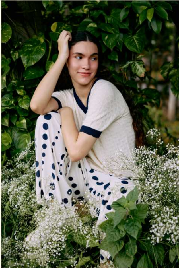
CT1014 Polka ivory