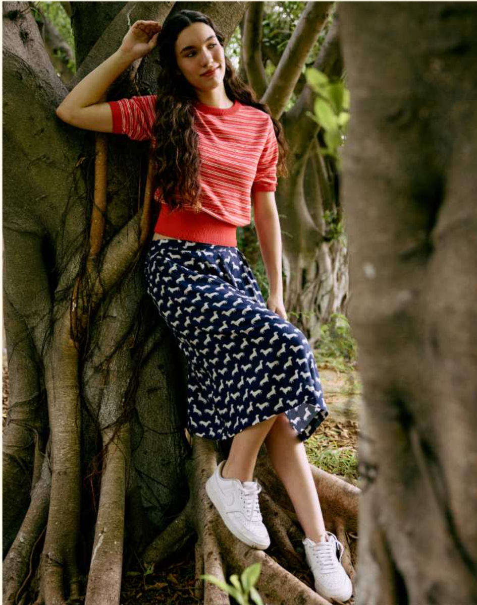
CS6005 Dascher Navy